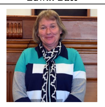
Deputy Mayor Karen Dudgeon

Email: <u>ebatt@southernmidlands.tas.gov.au</u>