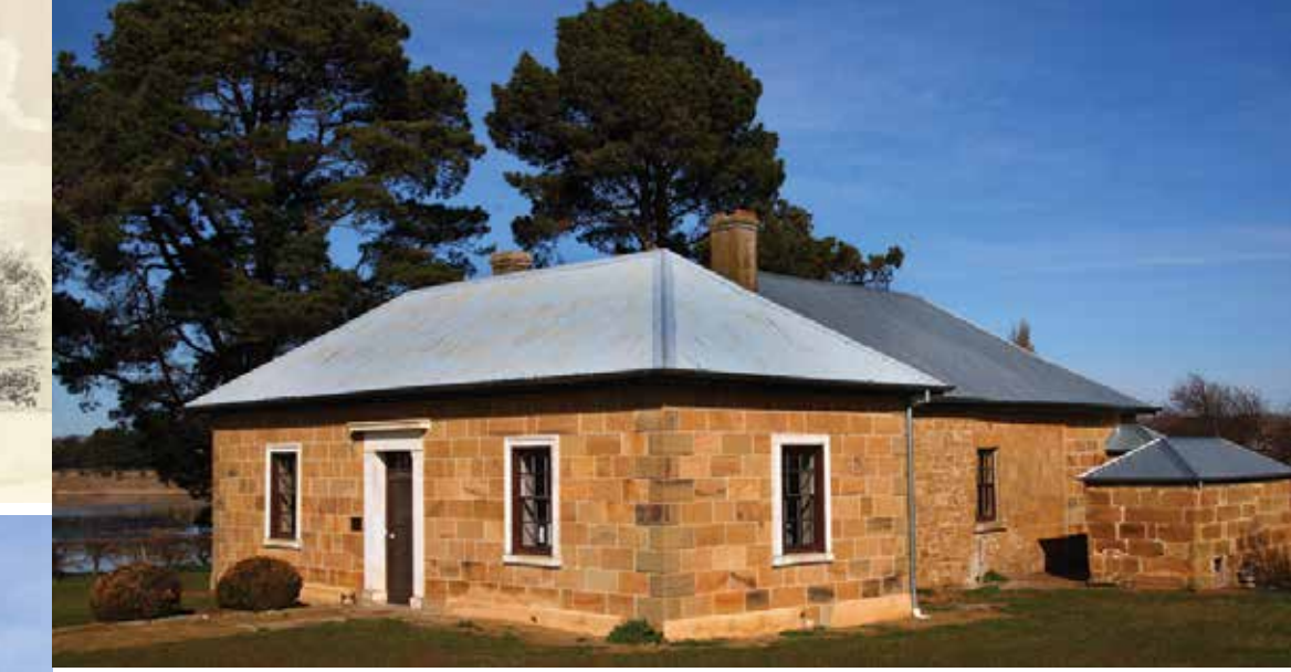
The Supreme Court House, Campbell Street

Built in 1829, the Court House is one of the oldest surviving buildings in Oatlands. The earliest part was constructed over the winter of 1829 by two convicts from the Oatlands chain