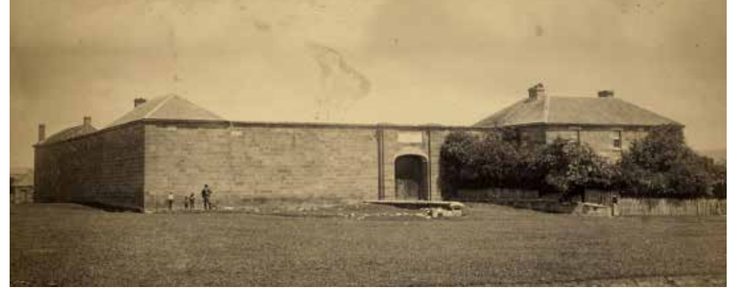
Exterior view of the Oatlands Gaol, circa 1908

Accommodation was provided for up to 270 prisoners, with a high stone wall separating the male and female divisions. At its peak, this was the largest regional gaol in Van Diemen's Land. The gaol was by far the largest structure in the township, with walls 30 feet high covering the whole block (for context, this is the same height as the gaolers' residence). As a gaol, the building was a bit of a failure, as it soon proved to be easily escaped from. By the early 1920s, the gaol held just two prisoners, leading the state government to begin demolition in the early 1830s. The swimming pool was built in the original gaol yard in 1954.