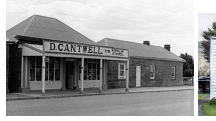
Cantwell's the Popular Stores