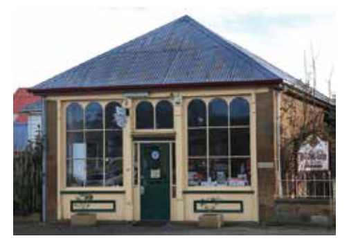
90 High Street

Barwick also claimed to have the best ostlers (grooms) available, a claim which was not entirely justified by the facts. One of the first ostlers was caught stabbing a customer's horse with a fork (he didn't like the customer).