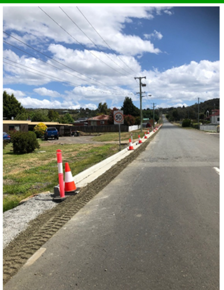
STAGE 1 - RHS Ch 48 to Ch 227 LHS Ch 21.5 to Ch 227

The design for Blackbrush Road is to construct kerb and channel and concrete footpath up to the vicinity of number 45 on the Southern side of the Road, given that was the area that received considerable damage in the flooding event of October 2020. Where the house lots are to some degree smaller at the Midland Highway end of the road, the design allows for paved off road car parking in lieu of a grassed nature strip to ensure that the road is not too congested with parked vehicles. This situation was arrived at after some consultation in the area. This can be seen in the design cross section, below where at a lower level the 'v' drain will act as a second defence barrier to future flooding events. On the northern side of the road the kerb, channel and footpath will go from the Highway up to the western boundary of the Community Hall, if the funds allow.