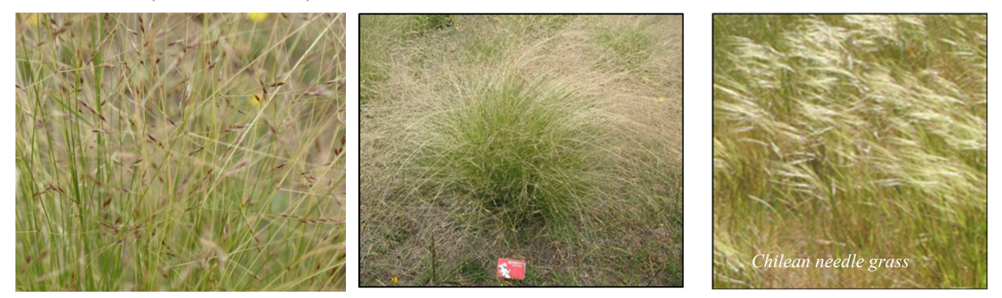
Chilean needle grass (Nassella neesiana)