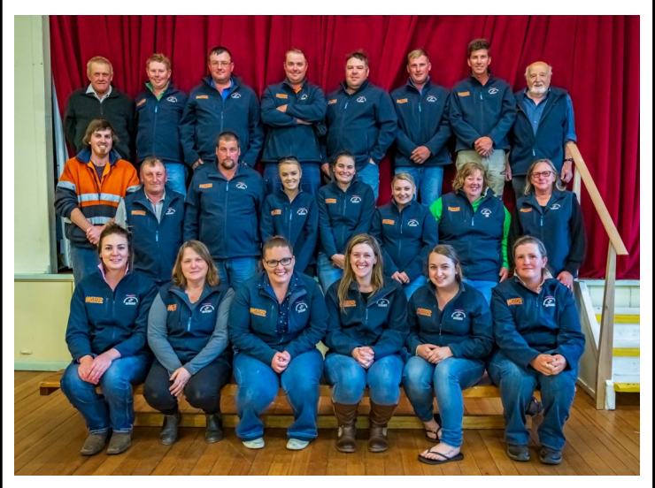
2019 marked the 20th Annual Melton Mowbray Rodeo - Congratulations to all the dedicated & hardworking committee members who volunteer their time to make this yet another successful community event.