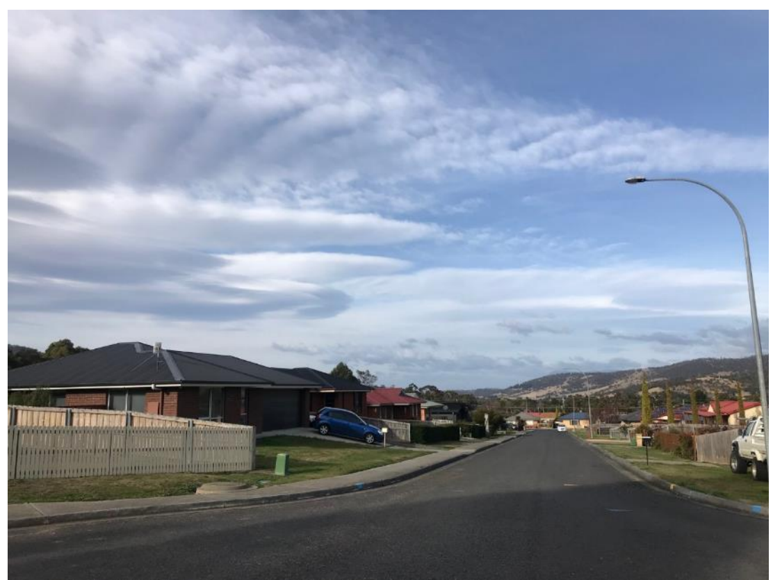
Figure 7: Le Compte Place, Bagdad