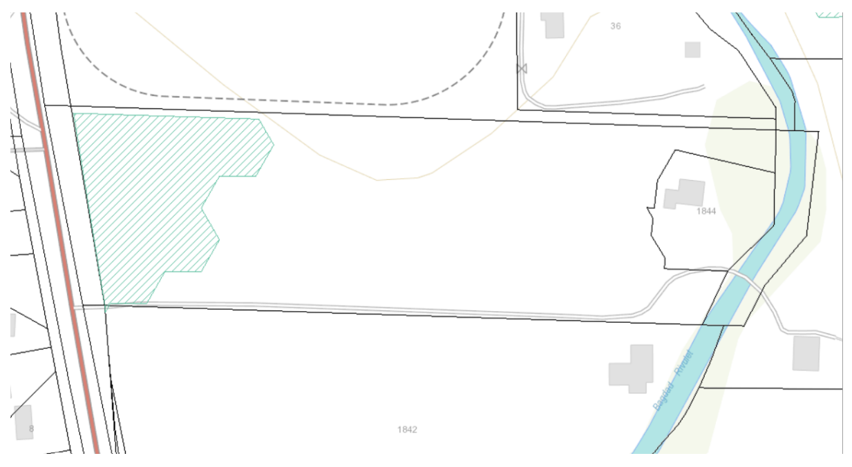
Figure 5: Priority Vegetation Overlay (Natural Assets Code)

Part of the land is mapped under the Priority Vegetation Overlay (PVO) under the Natural Assets Code of the Planning Scheme. This area is shown in figure 5.