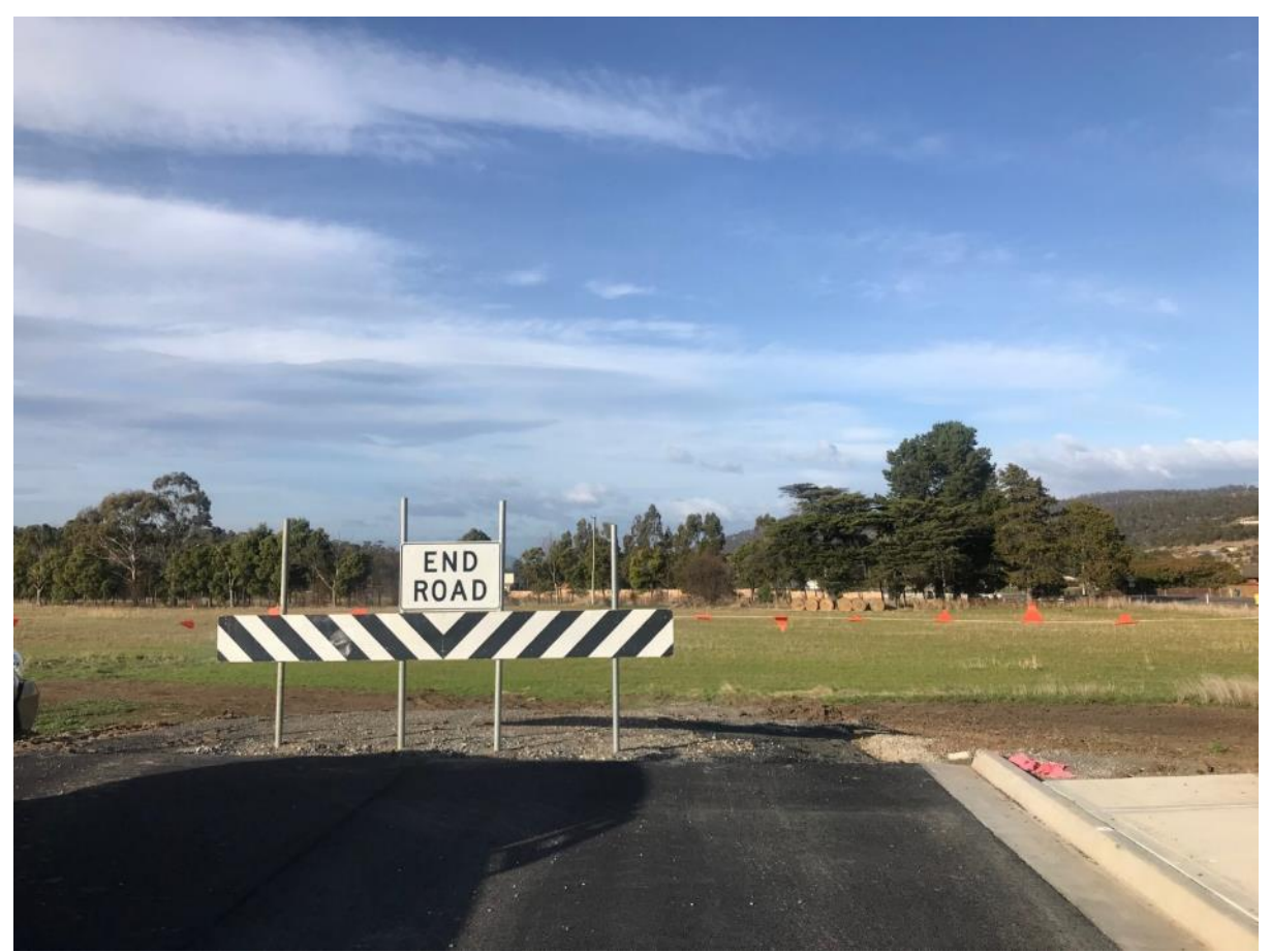
Figure 3: Photo of 1844 Midland Highway with future connection road from 10 East Bagdad Road