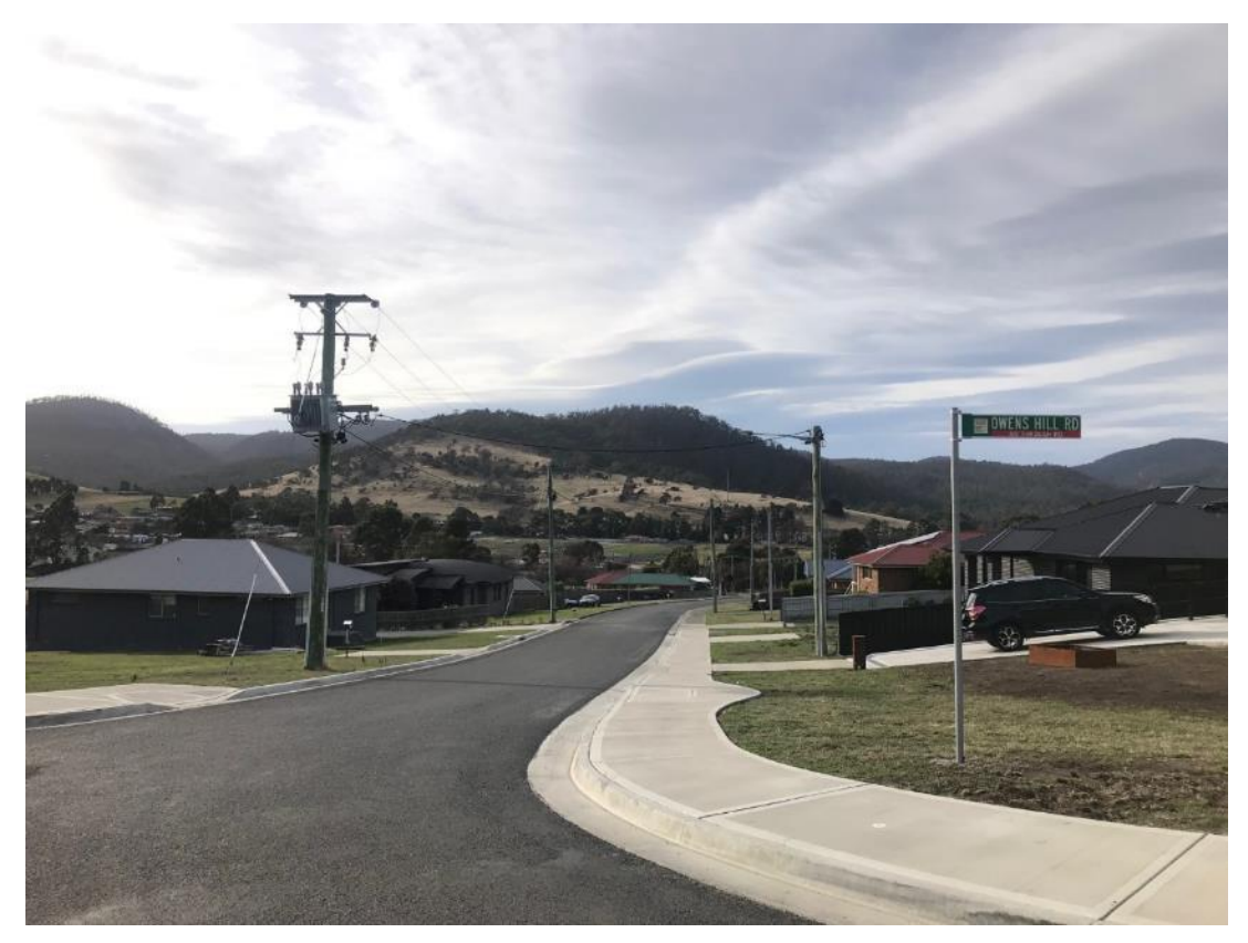
Figure 6: Owens Hill Road, Bagdad

There are two (2) small public parks, a service station, a shop, small workshops and home businesses located in the vicinity of the land. All are within a walkable 800m catchment of the land. The Bagdad community club, sports grounds, golf club, fire-station and childcare are located further south of the site (approximately 1.3km) and can be accessed via footpaths and walking tracks. Figure 6, Figure 7 and Figure 8 show the urban built environment around the land at 1844 Midland Highway.