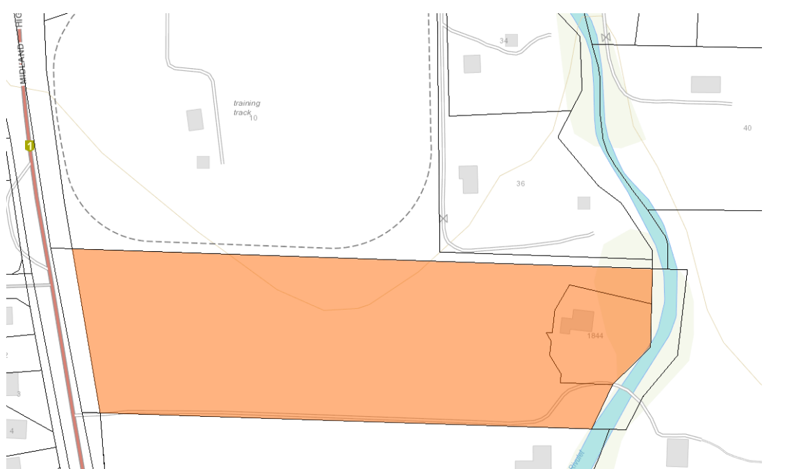
Figure 1: Application of the Village Zone to land at 1844 Midland Highway, Bagdad

The amendment would require a modification to the LPS zone maps for the two (2) titles only, to rezone the land from the Future Urban Zone to the Village Zone as shown in figure 1 below.