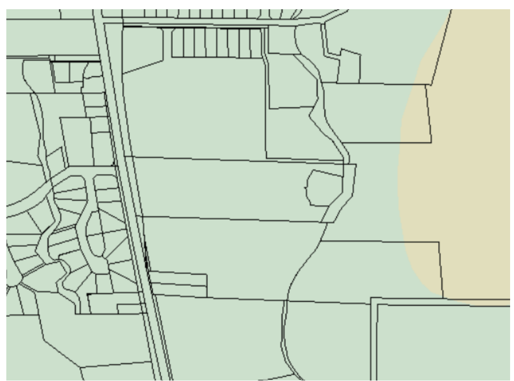
Figure 10: Land Capability map of 1844 Midland Highway

The proposed rezoning is compliant with the State Policy on the Protection of Agricultural Land 2009.