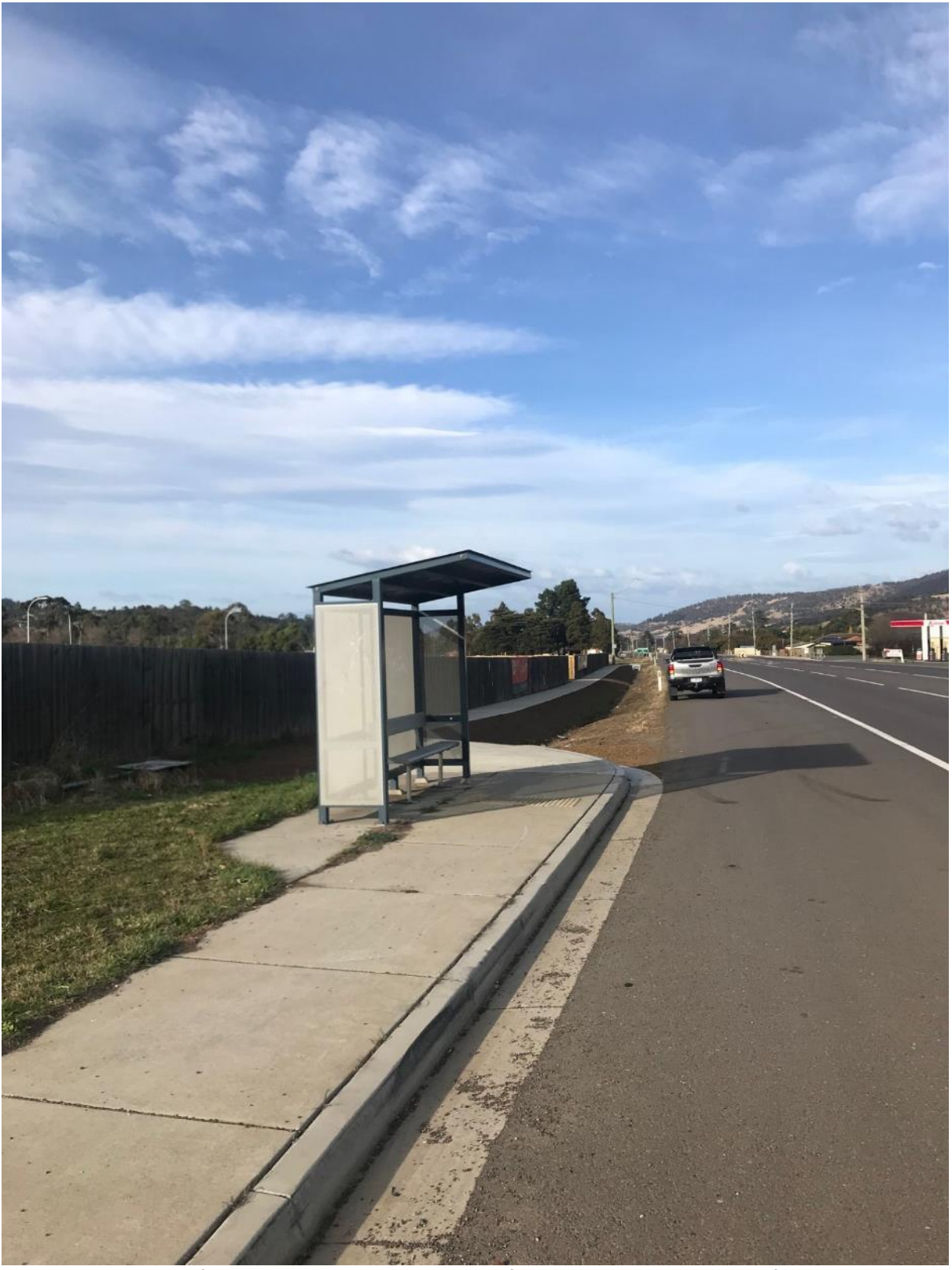
Figure 4: Photo of bus stop on eastern side of Midland Highway with footpath towards 1844 Midland Highway

Future subdivision of the land will require internal roads and footpaths to connect with the local network. A footpath has been completed within the 10 East Bagdad Road subdivision. There is also a walking track on the western side of the Midland Highway that connects with the Iden Road and Swan Street residential areas.