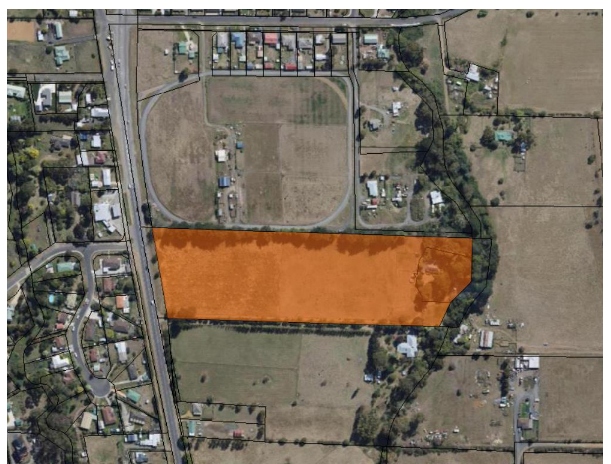
Figure 2: Aerial image of 1844 Midland Highway with surrounding area shown for context

The land is characterised by open pasture, fencing and a single dwelling located near the Bagdad Rivulet. Figure 2 below provides an aerial image of the site. There is connecting road through the adjoining 10 East Bagdad Road which is shown in Figure 3.