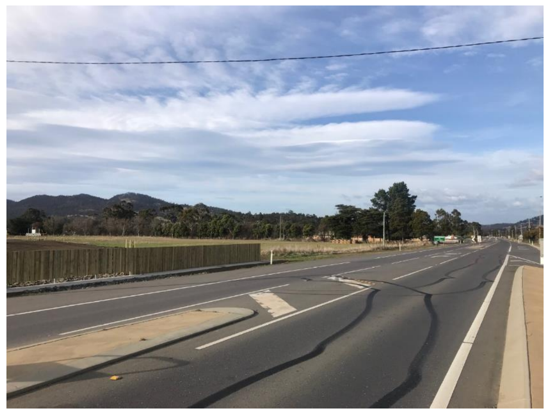
Figure 8: 1844 Midland Highway, Bagdad in streetscape setting

Based on the 2021 census, the population of the entire Bagdad locality (6354ha) is 1,482 and comprised of 563 dwellings (<u>https://www.abs.gov.au/census/find-census-data/quickstats/2021/SAL60026</u>, accessed 12<sup>th</sup> July 2023). Outside the village zoned areas