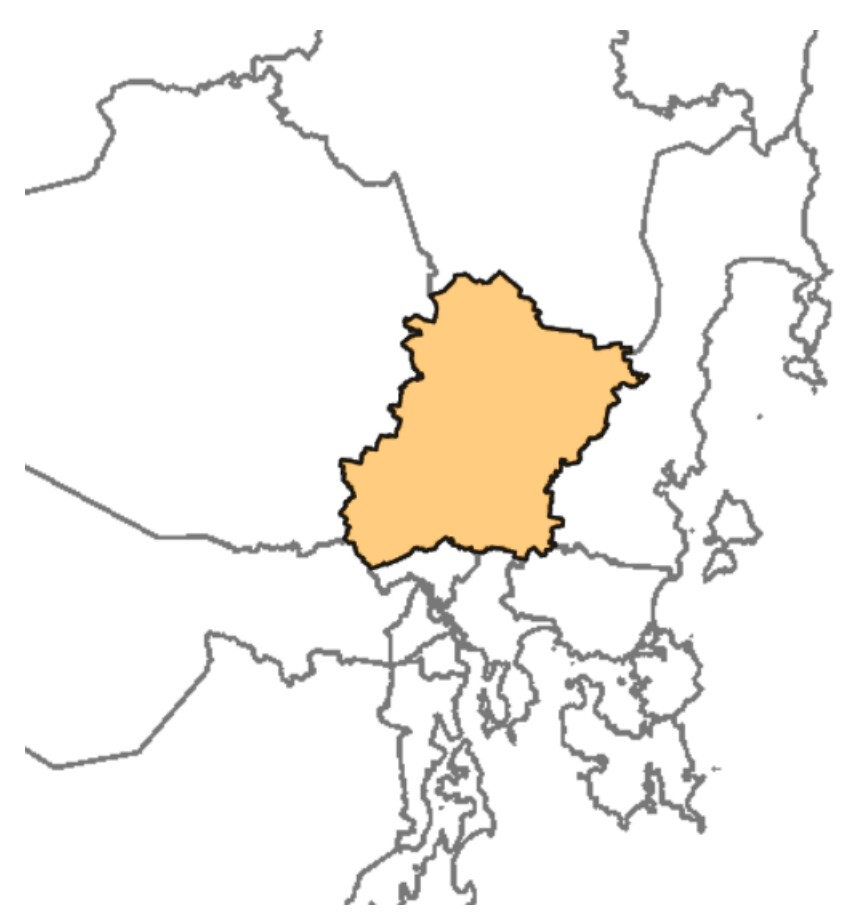
Figure 17: Southern Midlands LGA bordered by seven (7) other LGAs

However all these LGAs do not border with 1844 Midland Highway. The proposed Village Zone is also consistent with how zoning has been applied in the other LGAs in accordance, primarily with Section 34 of the Act and the Guideline No. 1 Local Provisions Schedule (LPS): zone and code application June 2018, prepared by the Tasmanian Planning Commission under section 8A of the Act.