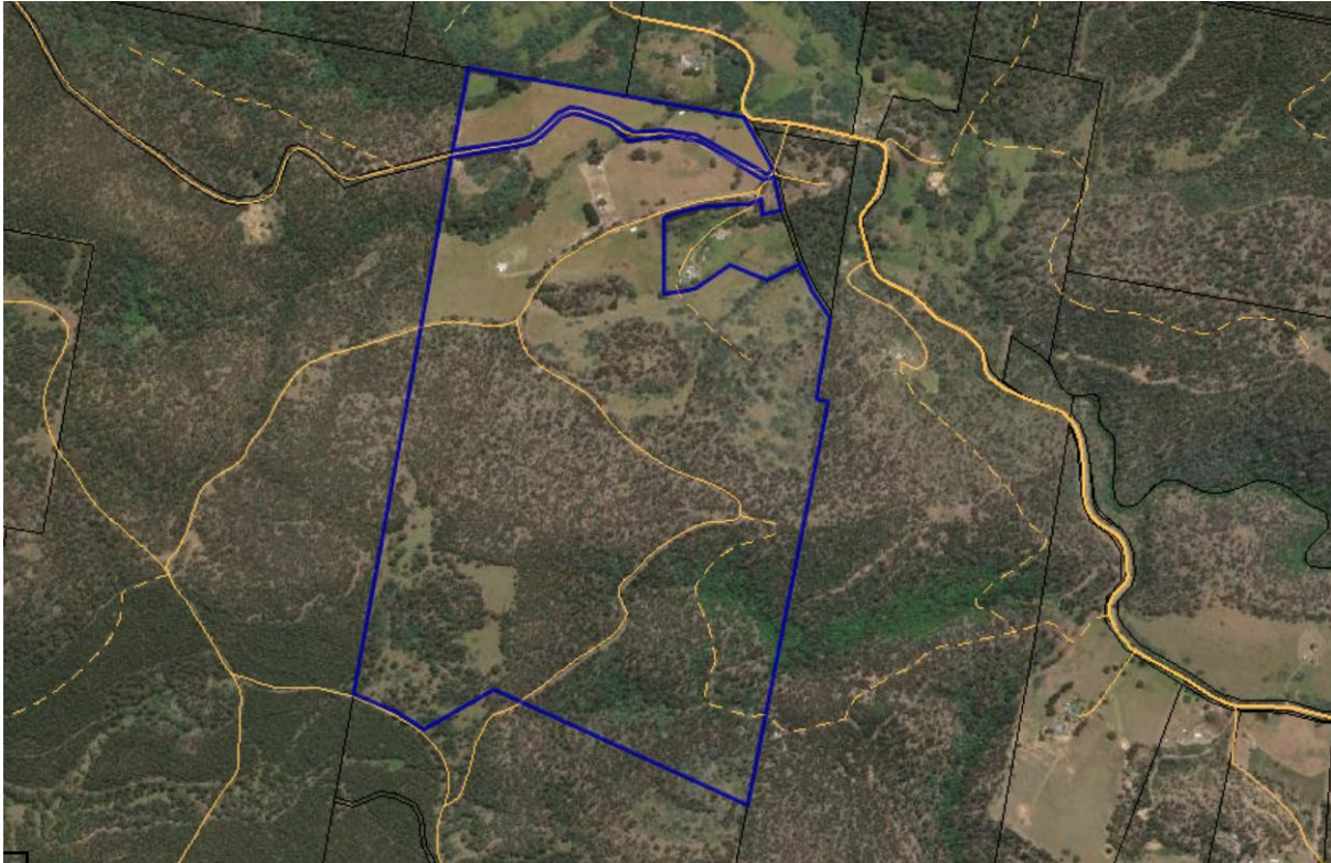
Map 1 _ Aerial image of the site. The subject land is defined by a blue line. Source: LISTmap (taken on 13/06/2025).

Maps 1 and 2 below show the location and zoning of the property and the surrounding area.