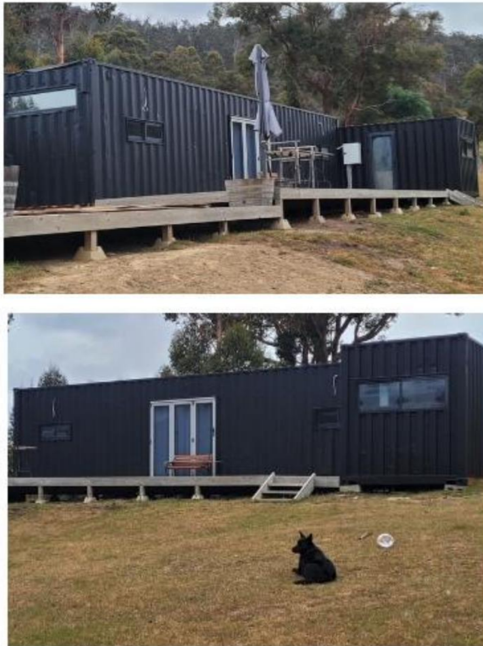
Figure 1. Photos of the existing studio

The application has been lodged under the Tasmanian Planning Scheme – Southern Midlands (“the Planning Scheme”).