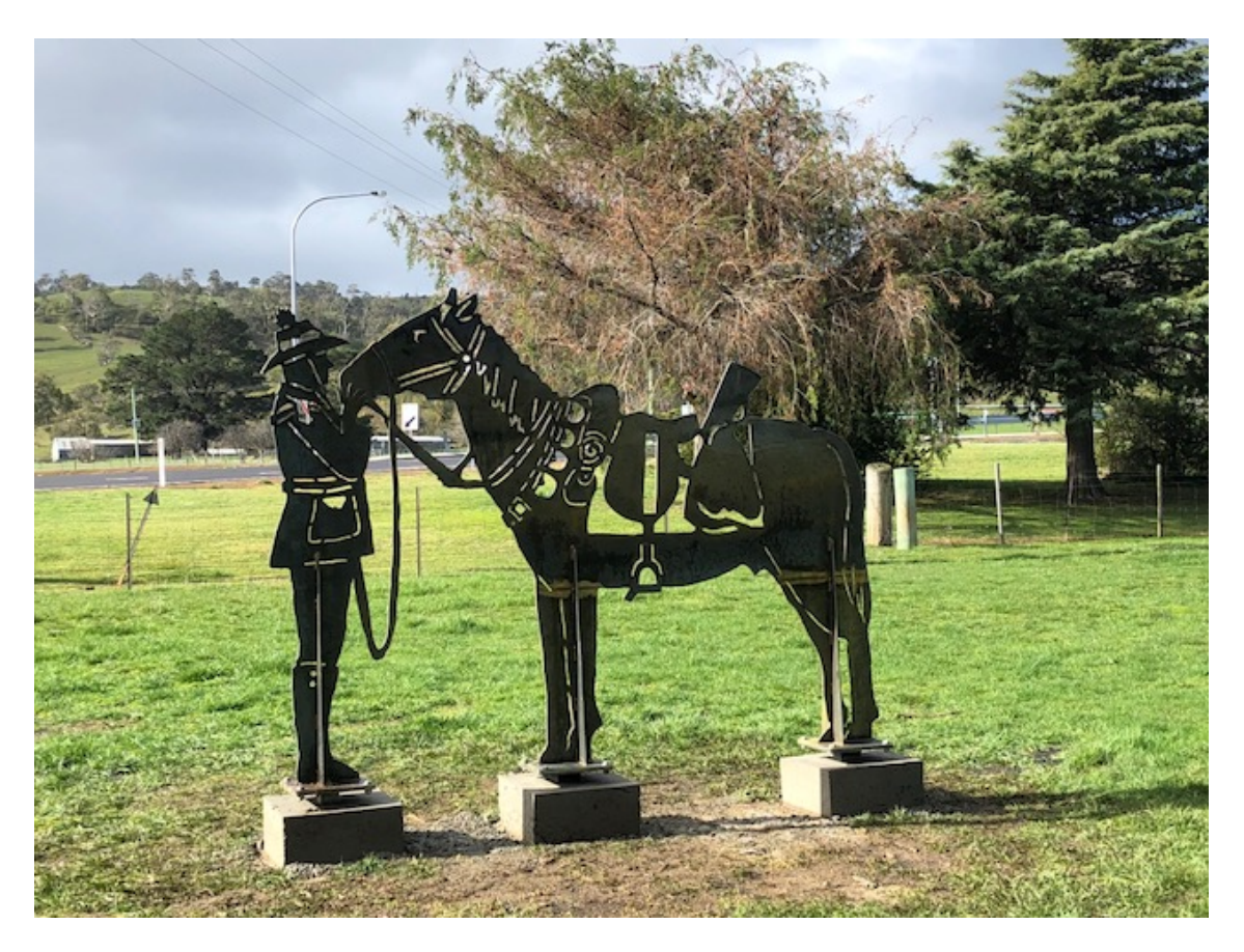
LIGHT HORSE SCULPTURE BY FOLKO KOOPER & MAUREEN CRAIG