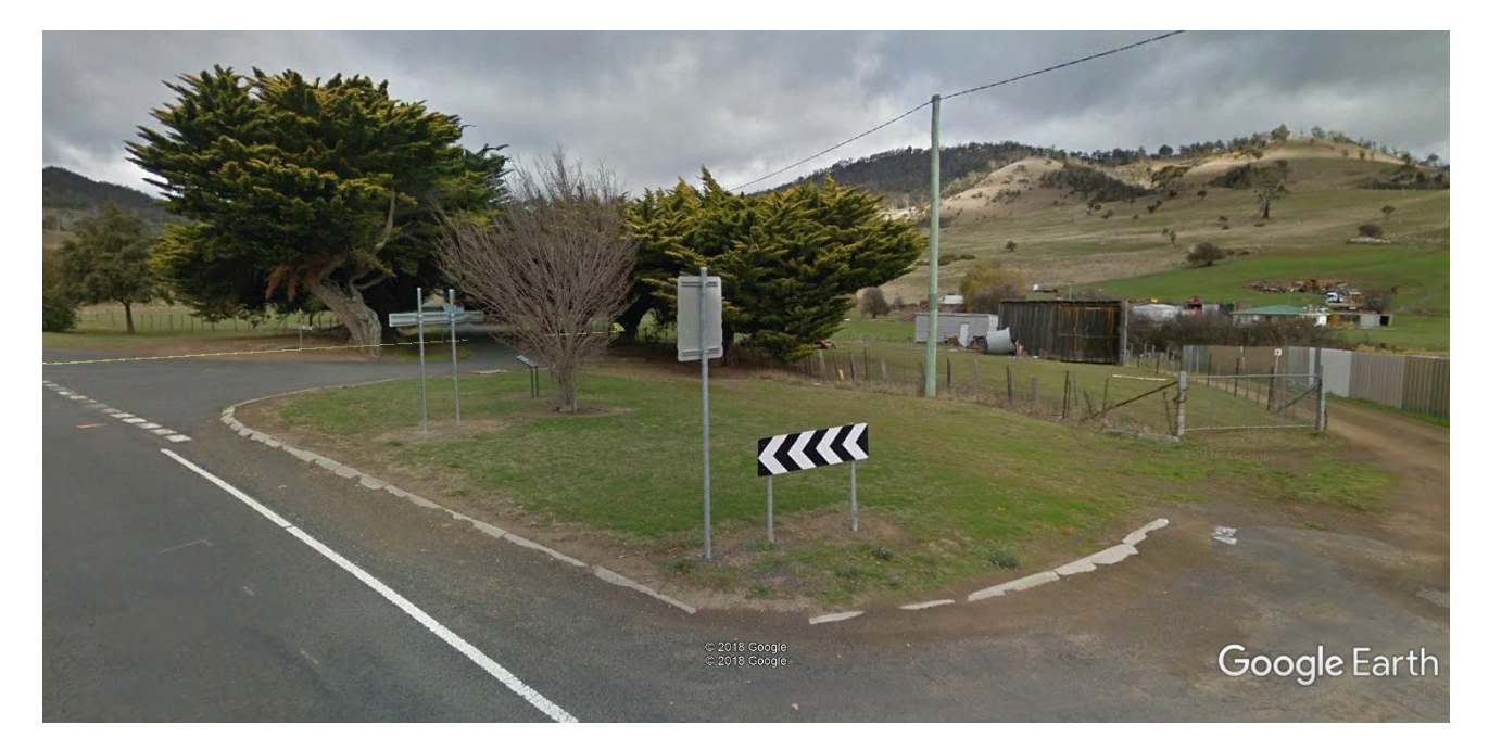
STAGE 1 - AFTER