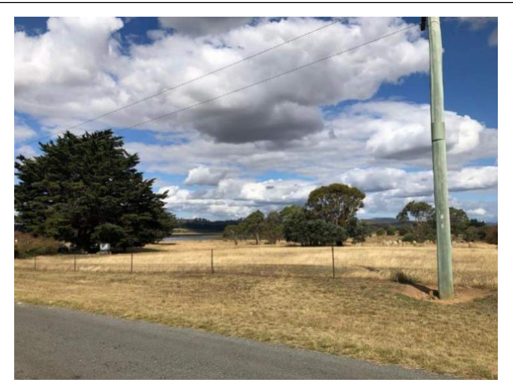
Chatham Street Site

Option 1 Chatham Street site. Preferred location by the Community Grp