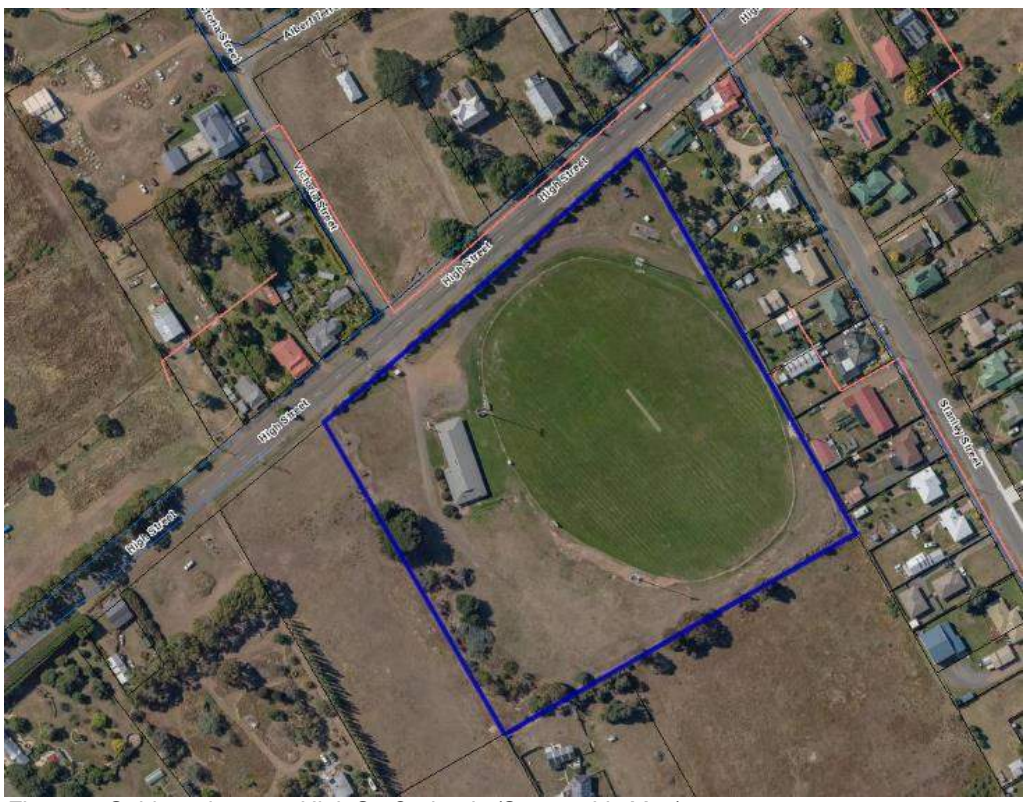
Figure 3: Subject site at 29 High St, Oatlands

The site adjoins properties in the General Residential Zone and property in the General Business Zone. The land on the opposite side of High Street is in the Community Purpose Zone. The land in the Community Purpose Zone and General Business zone are also listed places on the Tasmanian Heritage Register under the Historic Cultural Heritage Act 1995 .