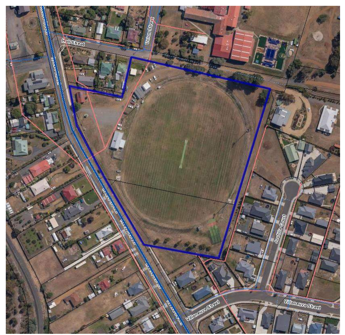
Figure 1: Subject site at 30-34 Reeve St, Campania