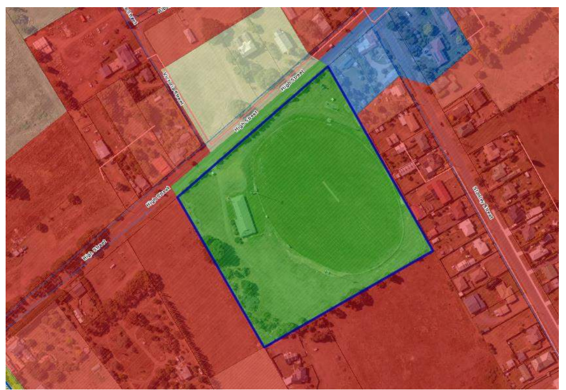
Figure 4: Zoning and overlay map of site and surrounds. Red=General Residential Zone, Blue-=General Business Zone, Pale Yellow=Community Purpose Zone, Green hatching Oatlands township local heritage precinct (Source: ListMap).