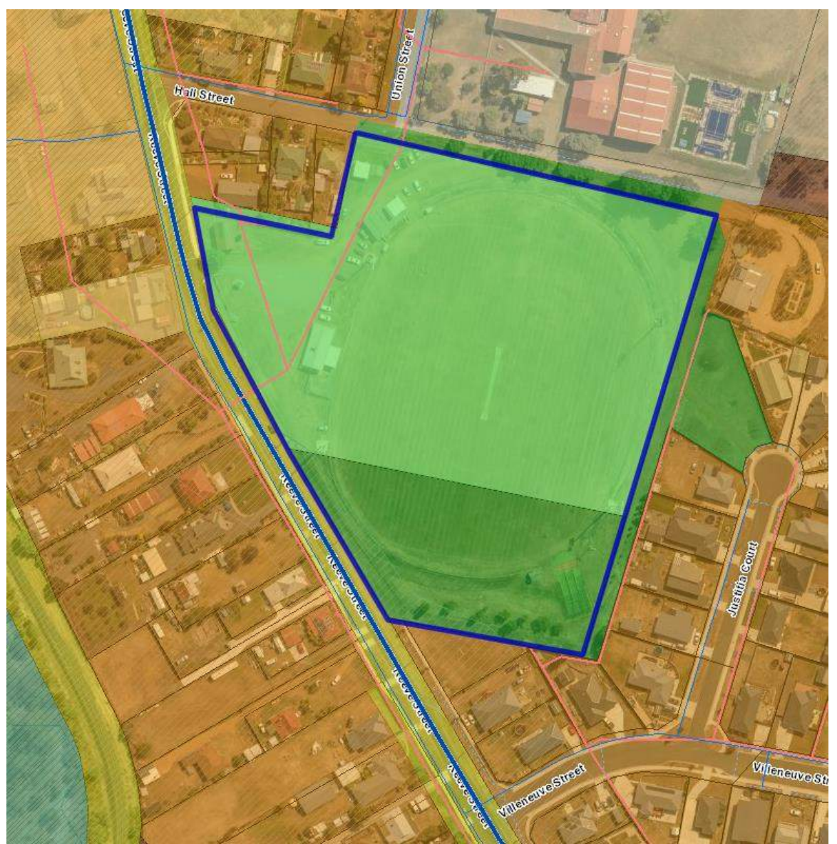
Figure 2: Zoning and overlay map of site and surrounds. Green = Recreation Zone, Yellow=Village Zon, Pale Yellow=Community Purpose Zone, Green overlay=Local Heritage Place (War Memorial Hall).