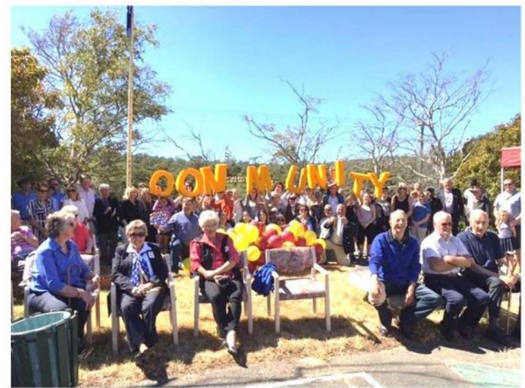
Community Event - Southern Midlands

"Never doubt that a small group of thoughtful, committed people can change the world. Indeed it is the only thing that ever has."