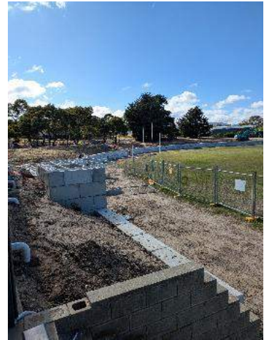
Campania Football Club retaining wall works